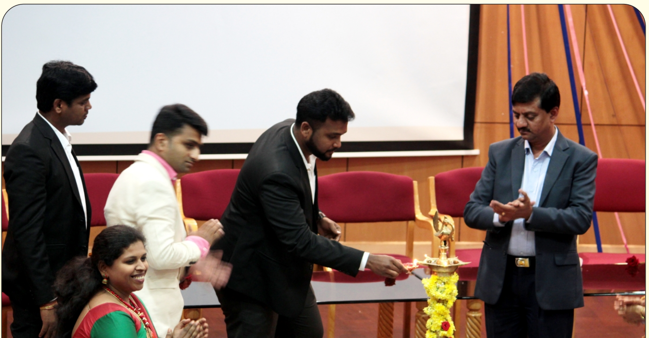
COSMOS - 2018 INAUGURATION